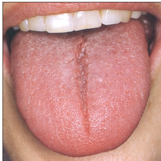
Figure 6.1.2.5 Female 40 years old

Kidney yin deficiency with heat in the Heart and Stomach Constitutional heat in the Heart Normal