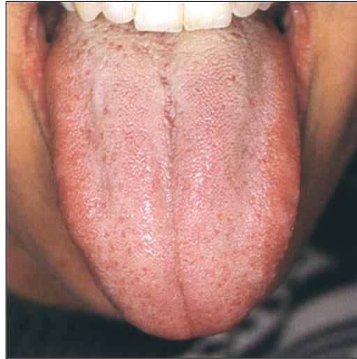
Figure 6.1.2.4 Female 38 years old

Normal Heat in the Liver Heat in the Heart Accumulation of damp-heat